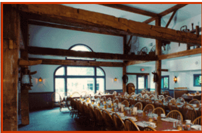
The Carriage Room at Tillman's Village Inn